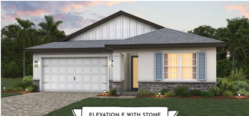
ELEVATION E WITH STONE