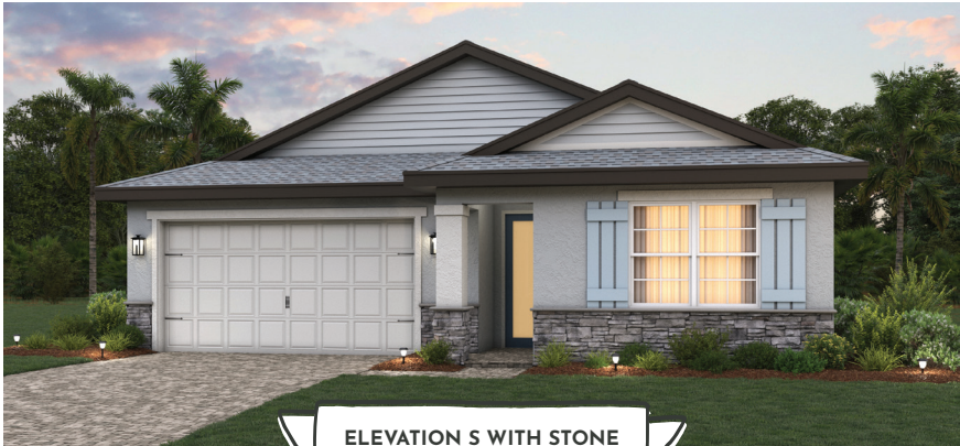
ELEVATION S WITH STONE