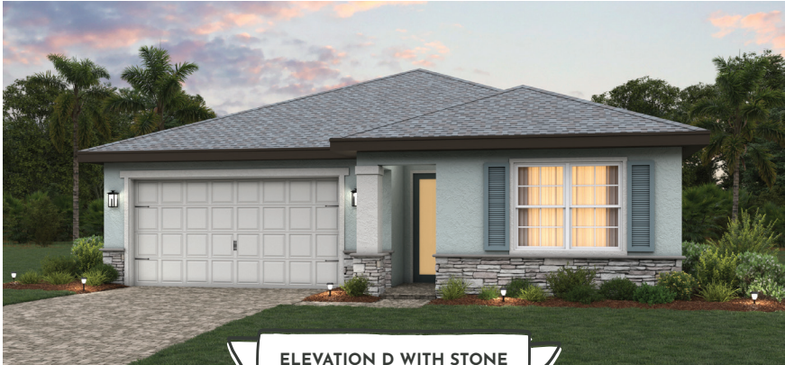
ELEVATION D WITH STONE

3 beds · 2.5 baths · 2-car garage · 1,922 sf a/c