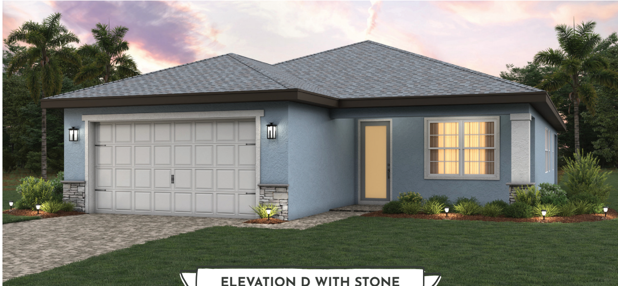
ELEVATION D WITH STONE

3 beds · 2 baths · 2-car garage · 1,720 sf a/c