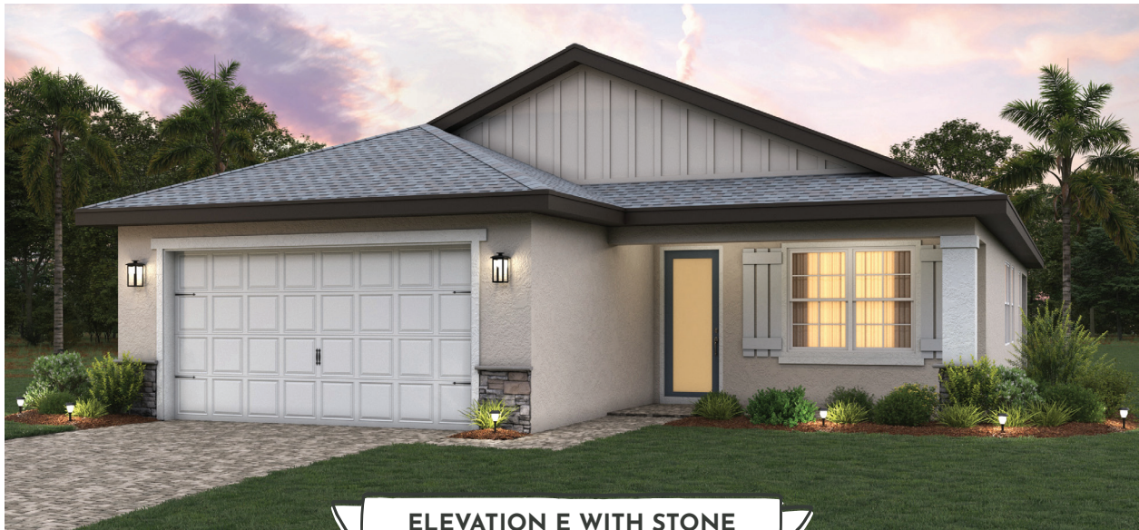
ELEVATION E WITH STONE